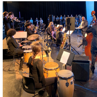
Booker T. Washington Big Band performing during the D'JAM Jazz Stroll